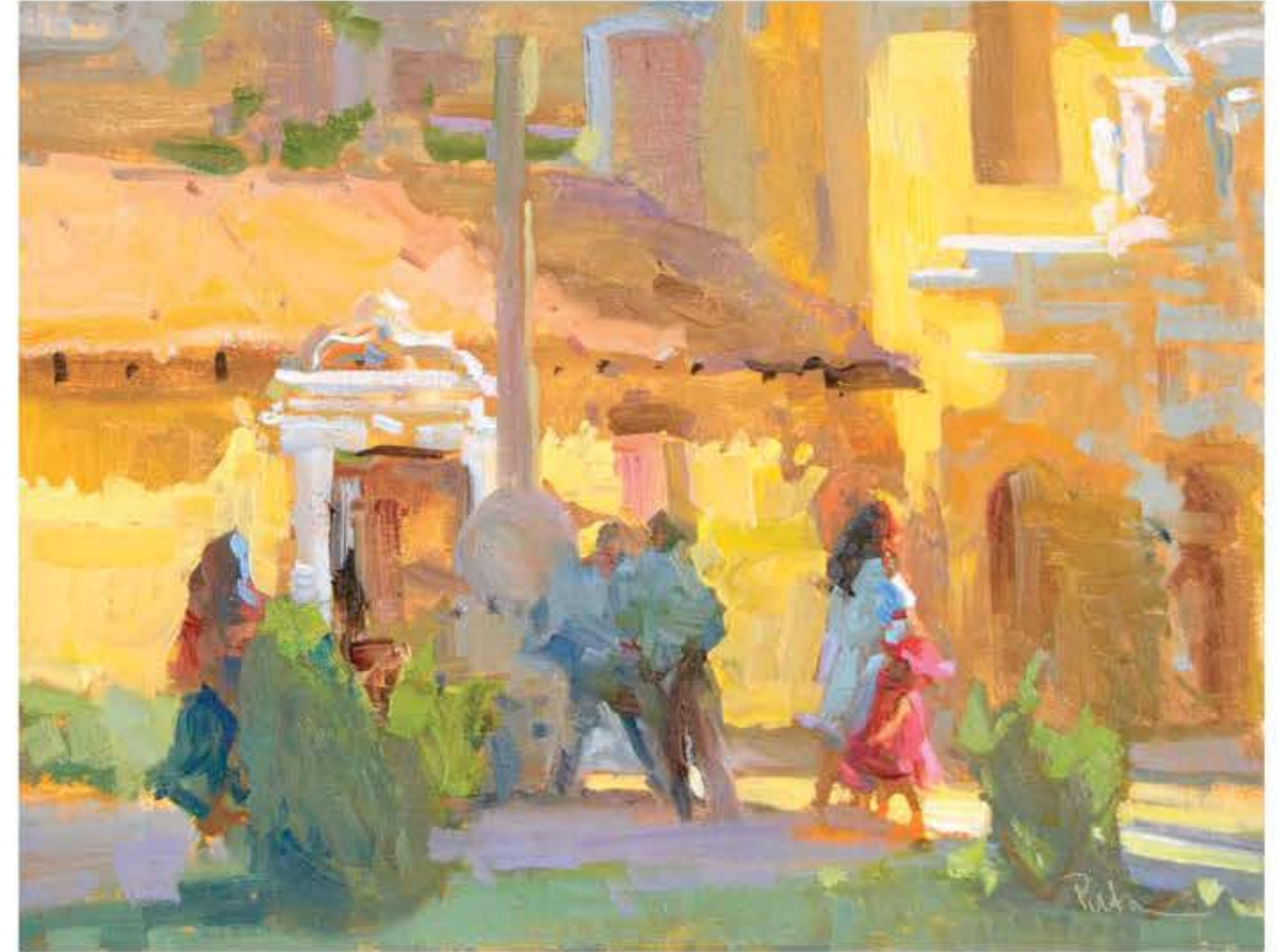
similar to those used in a studio piece from 2020 titled Sicilian Roots (page 103).