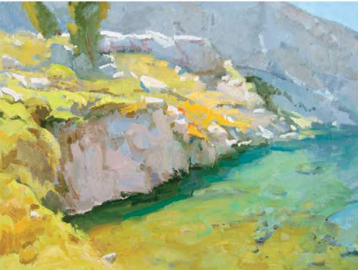
Triptych: Tribute to the Eastern Sierra 2022 Oil on linen on panel 18 in x 72 in Iceberg Lake, Eastern Sierra, California