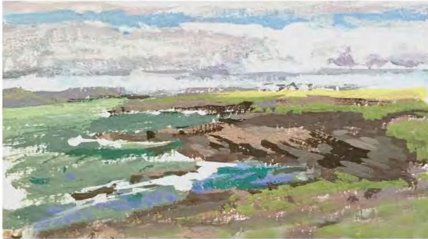
Hookhead Lighthouse is a favorite painting location for artists who participate in the Art in the Open festival in Ireland. This gouache was a quick "catch" at the end of a long day of oil painting.