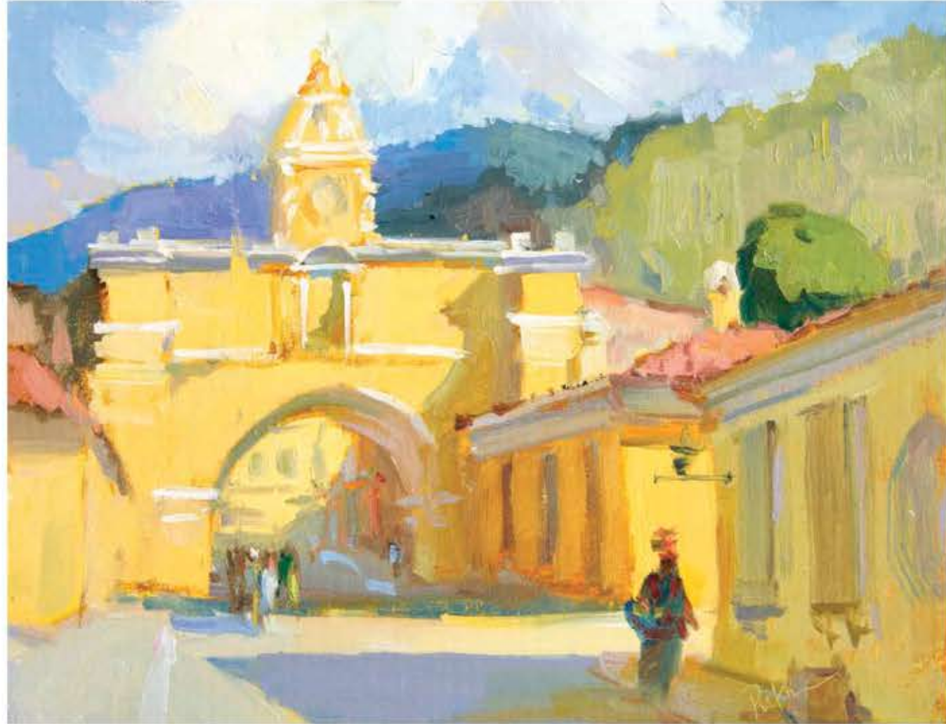
The work I do in plein air informs my studio painting. The reverse is also true. These two plein air pieces from Guatemala in 2021 and 2022 have colors and values