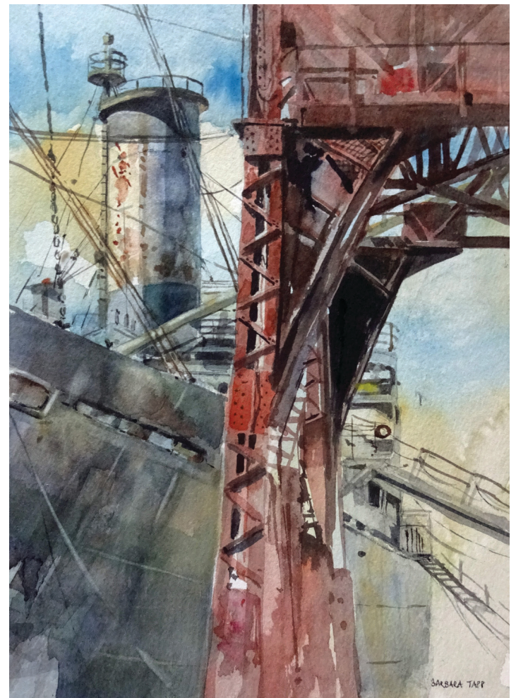
(CLOCKWISE FROM TOP LEFT) Between Tides , John Caggiano, 2018, oil, 16 x 20 in., available from artist, plein air • Blowing In , Jill Basham, 2019, oil, 12 x 12 in., private collection, plein air • Funnel Versus Crane, SS Red Oak Victory , Barbara Tapp, 2018, watercolor, 10 1/2 x 7 1/2 in., private collection, plein air • Far Light , Krystal Brown, 2019, oil, 16 x 20 in., private collection, plein air