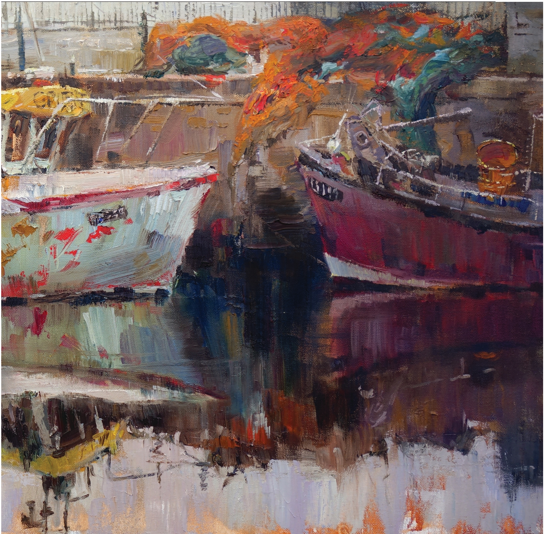
Misty Day on Whitstable Harbor, Tiffanie Mang, 2019, oil, 18 x 36 in., available from artist, plein air and studio