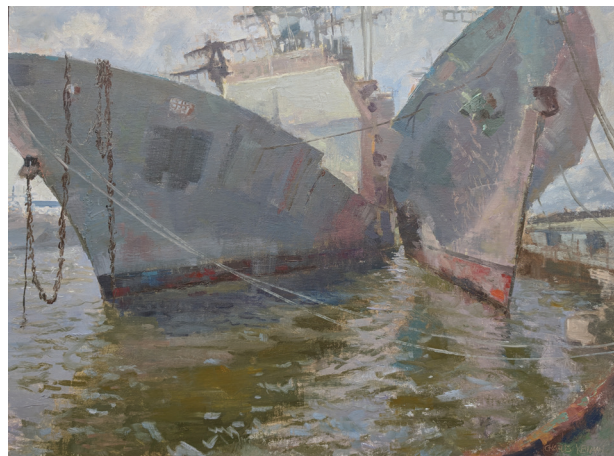
• (BOTTOM LEFT) Dockside , Stephanie Amato, 2018, oil, 9 x 12 in., available from Four Corners Gallery, Bluffton, SC, plein air • (BOTTOM RIGHT) Last Light , Joli Ayn Wood, 2019, oil, 11 x 14 in., available from True Grit Art Gallery in Middleboro, MA, plein air