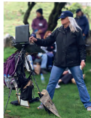
Teaching, Yorkshire, England