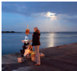
Art in the Open, Ireland