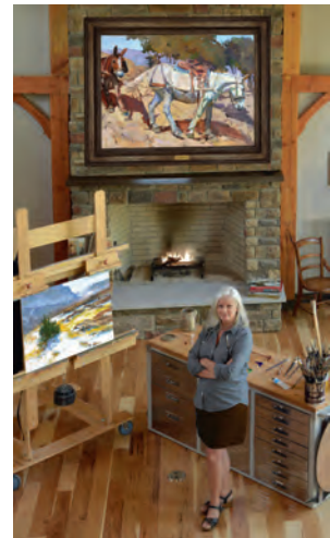
Putnam Fine Art Studio